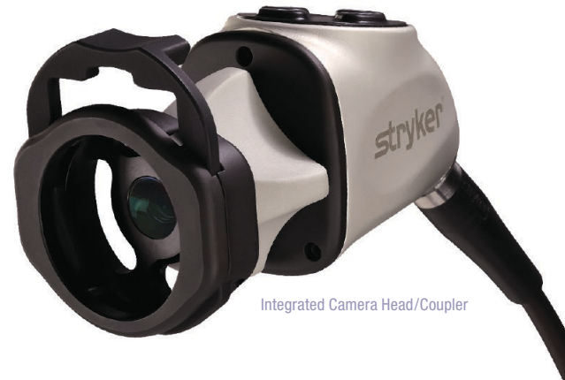
Integrated Camera Head/Coupler