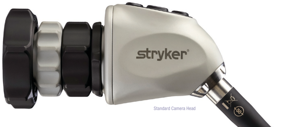
Standard Camera Head