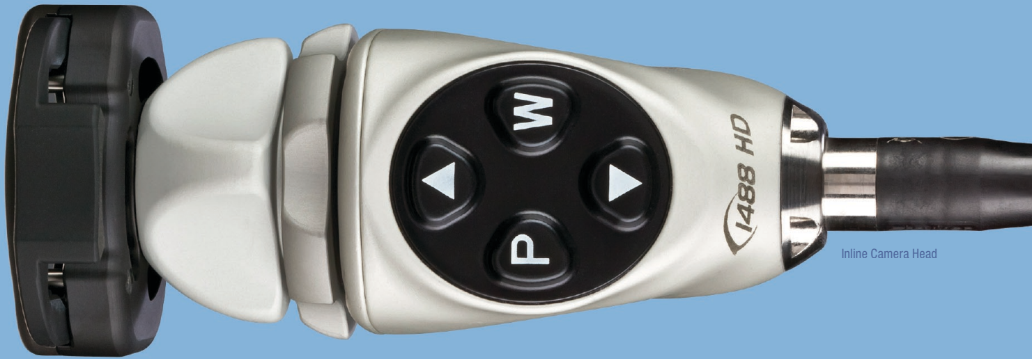
Inline Camera Head